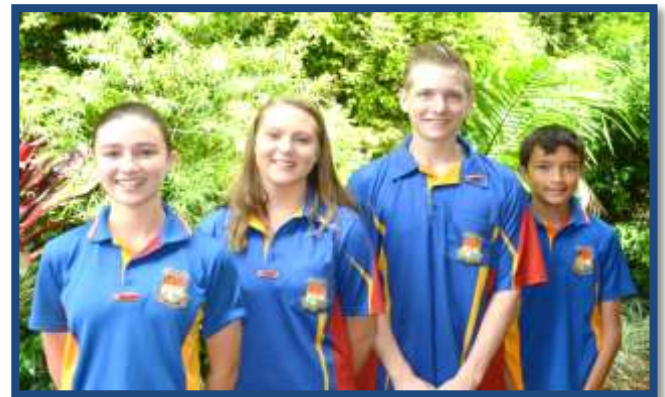
Barrine Sports Captains