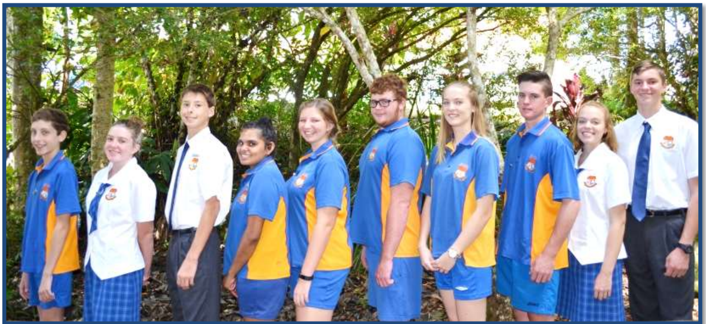
Year Level Captains

If your student is absent please use one of the following options: Phone the school office on 40967111 on the morning of the absence OR Email to absentees@malandashs.eq.edu.au