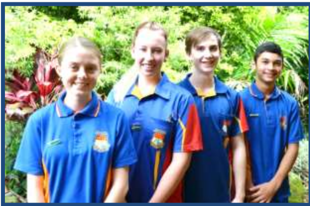
Tinaroo Sports Captains