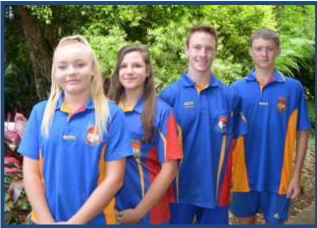
Eacham Sports Captains