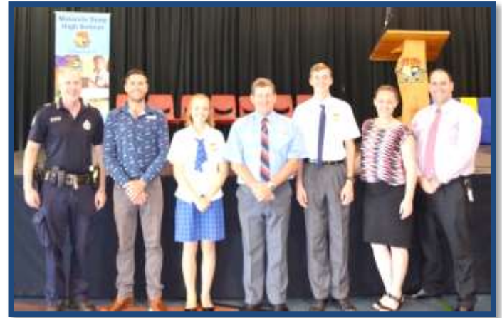
Special Guests at the Induction Ceremony