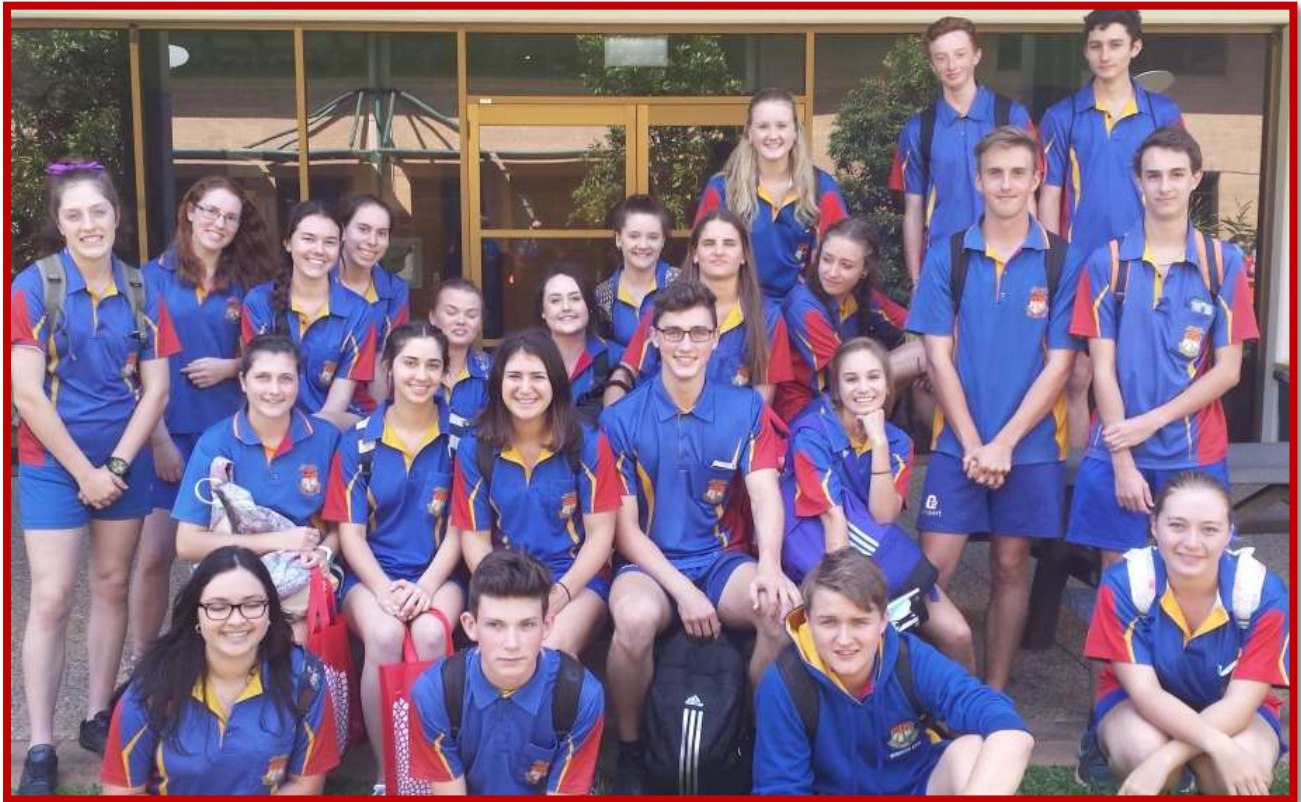
Senior students at JCU